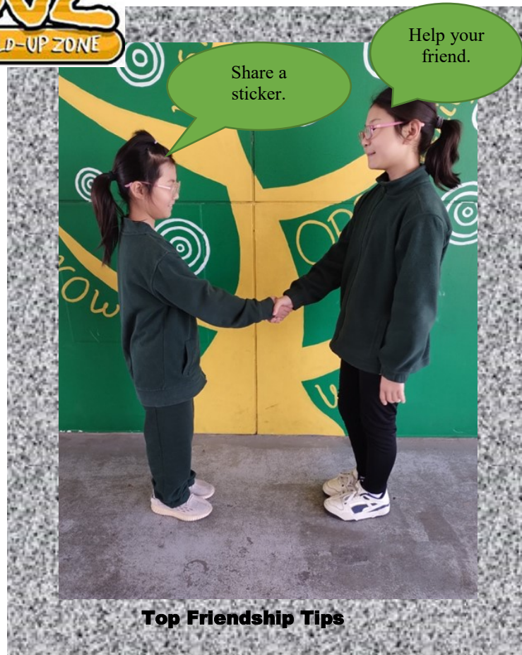
Top Friendship Tips

The Thornlie Primary School Chaplain is available in the Community Room for a confidential 'chat' with students, families and staff from the school community on Mondays, Tuesdays and Fridays. Appointments can be made through the school office on 9232 3450, or just drop in to the Community Room.