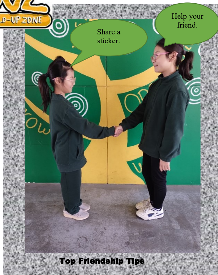
Top Friendship Tips

The Thornlie Primary School Chaplain is available in the Community Room for a confidential 'chat' with students, families and staff from the school community on Mondays, Tuesdays and Fridays. Appointments can be made through the school office on 9232 3450, or just drop in to the Community Room.