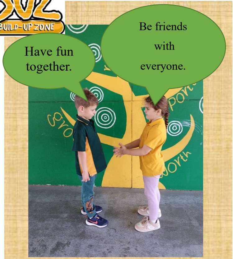
Top Friendship Tips

The Thornlie Primary School Chaplain is available in the Community Room for a confidential 'chat' with students, families and staff from the school community on Mondays, Tuesdays and Fridays. Appointments can be made through the school office on 9232 3450, or just drop in to the Community Room.