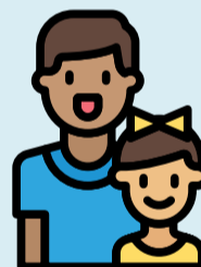
Parents attending KindiLink more than once a week