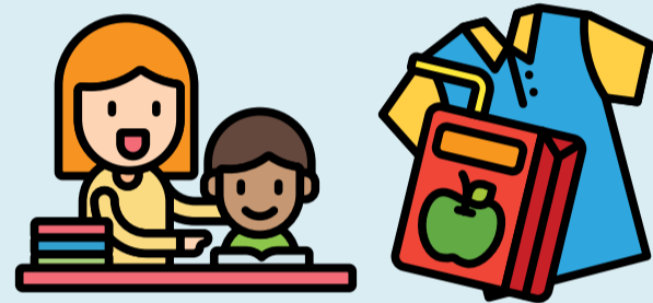
Volunteering or working (classroom, school canteen or uniform shop) more than once a week