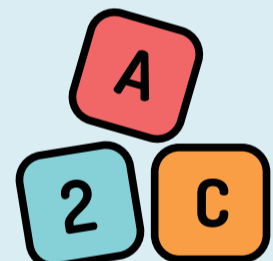
Assisting in-class literacy and numeracy programs more than once a week