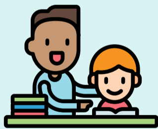
Volunteering (once a week or less)